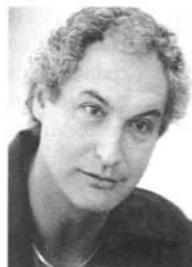
Dr. Carl Hammerschlag

www.keyspeakers.com Standard fee: $5,000 to $10,000