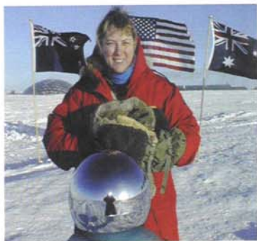
Dr. Jerri Nielson

Last year, Dr. Jerri Nielsen's battle against breast cancer, in what arguably is the world's loneliest and most unforgiving spot, the South Pole, gripped the nation. Penned in by adverse weather (average temperatures hovered around minus 58 degrees Fahrenheit) and growing sicker by the day, Nielson, a research scientist at the National Science Foundation's Amundsen-Scott South Pole Station, became both doctor and patient, undergoing four months of largely self-administered chemotherapy,